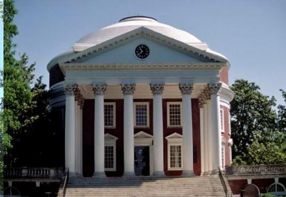
Rotunda of the University of Virginia