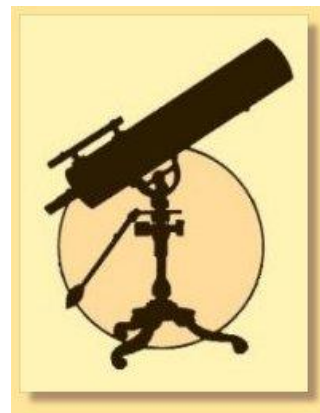
Antique Telescope Society