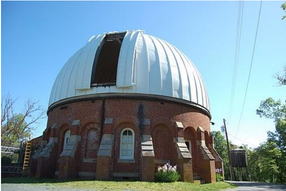
Leander McCormick Observatory