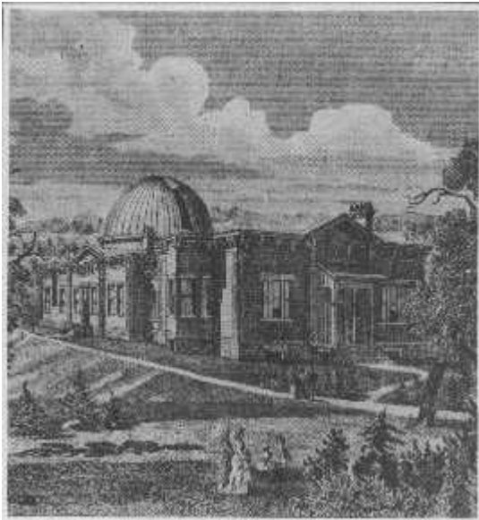
Washburn Observatory, Madison, WI